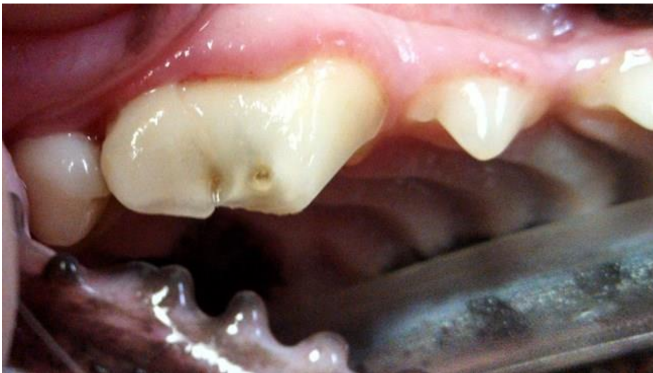
Surgery Before and After – tooth surgically removed and the gingival flap sutured closed