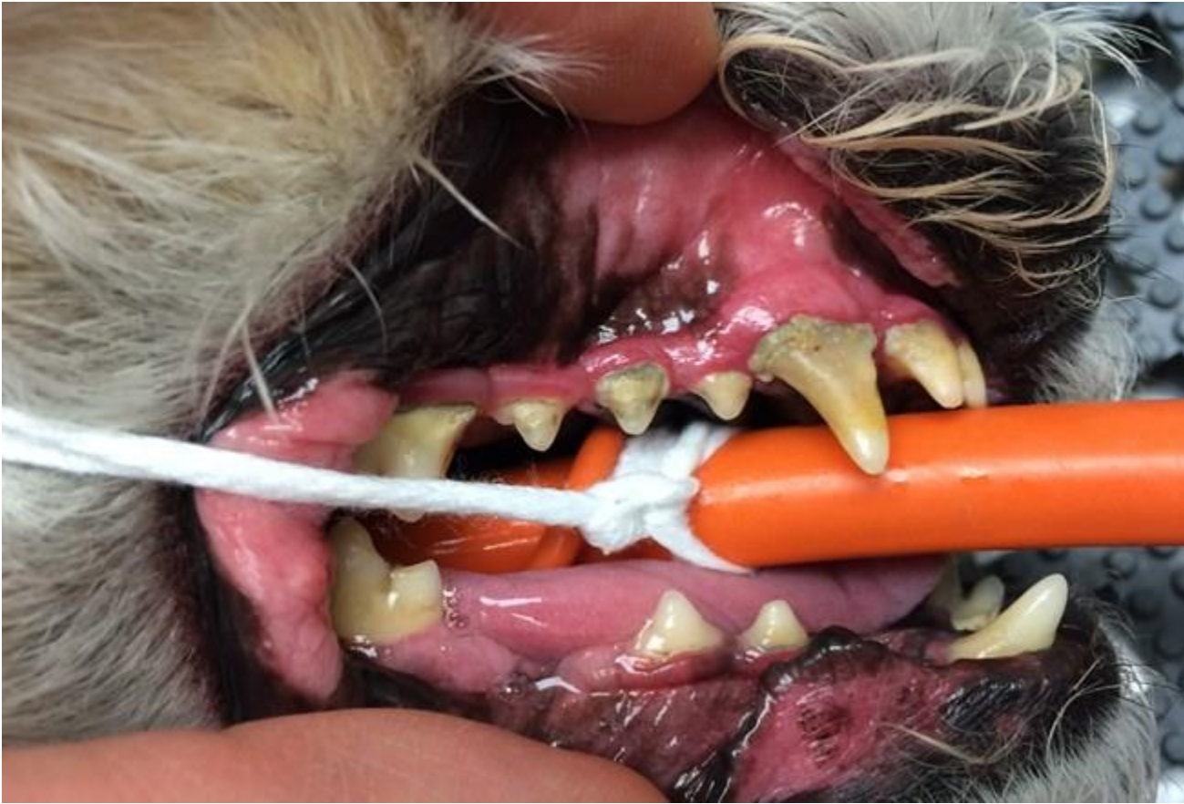
Stage 2 Dental Disease - After Cleaning - No permanent disease issues